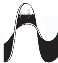
Left hand pitch