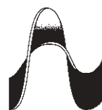
Left hand pitch